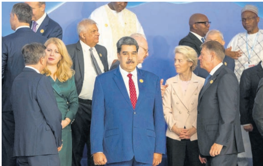
Venezuela's President Nicolas Maduro, center, stands next to the President of the European Commission Ursula von der Leyen, center right, as leaders prepare themselves for a group photo at the COP27 U.N. Climate Summit in Sharm el-Sheikh, Egypt, Nov. 7, 2022.

The South American country has the world's largest